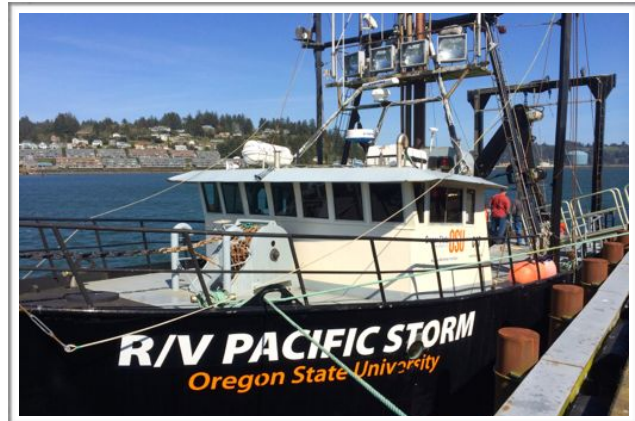
The scientists and crew of the Oregon State University research vessel Pacific Storm welcomed ARCS visitors aboard